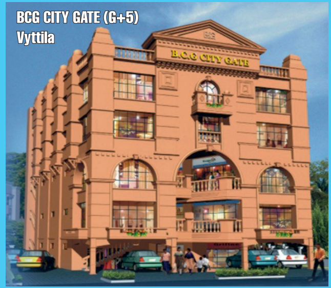
BCG CITY GATE (G+5) Vyttila