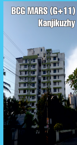
BCG MARS (G+11) Kanjikkuzhy