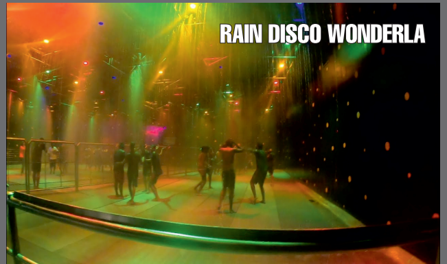
RAIN DISCO WONDERLA