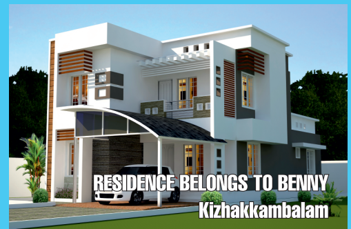
RESIDENCE BELONGS TO BENNY Kizhakkambalam