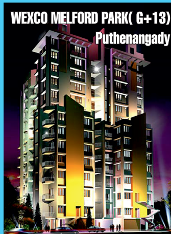
WEXCO MELFORD PARK( G+13) Puthenangady